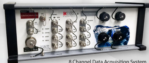
8 Channel Data Acquisition System